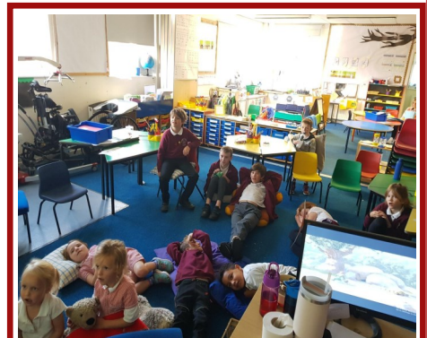
Film Club was a hit. The children enjoyed watching Shrek