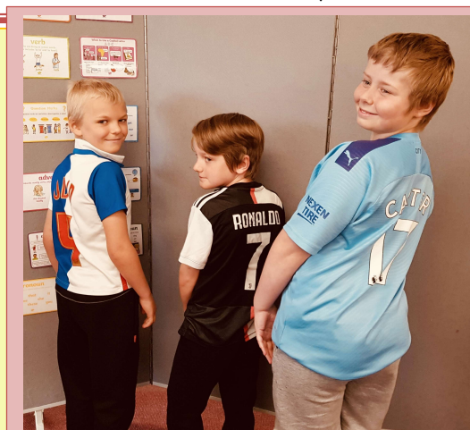
Today's NSPCC Number's Day in school

Wrap-around Care - all payments are due in advance when booking please Breakfast Club is open from 8.15am until 8.45am £2 per child, per session After-school Club runs from 3.15pm until 5pm at £4 per child, per session. Please book a week in advance to allow staff planning. If less notice is given, we cannot guarantee availability.