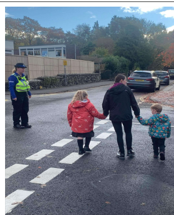
Our Explorers learning road safety this week