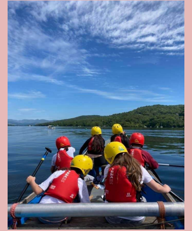
Our Trailblazers at YMCA Lakeside yesterday

We have had another super-busy week in school. Yesterday, the Trailblazers spent the day at Lakeside YMCA. To help our families, school paid for the trip for a leavers' treat. We always aim to give our children as many opportunities as we possibly can and we are so lucky to be in the Lake District National Park. Next Wednesday, KS2 are having their final water sports session on the lake and then we are visiting Tree Top Nets at Brockhole on Thursday.