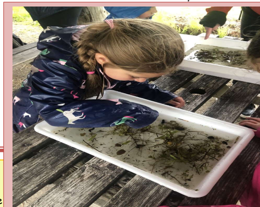
We had an amazing whole school trip to Brockhole yesterday