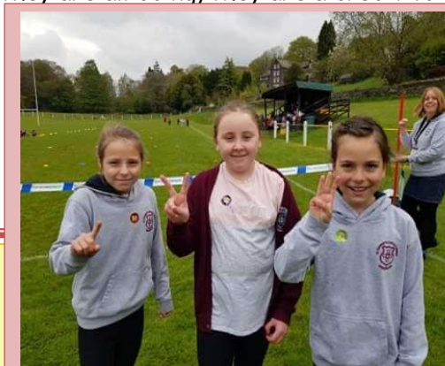
Sports Day 2021 - Go Team Cuthbert's!