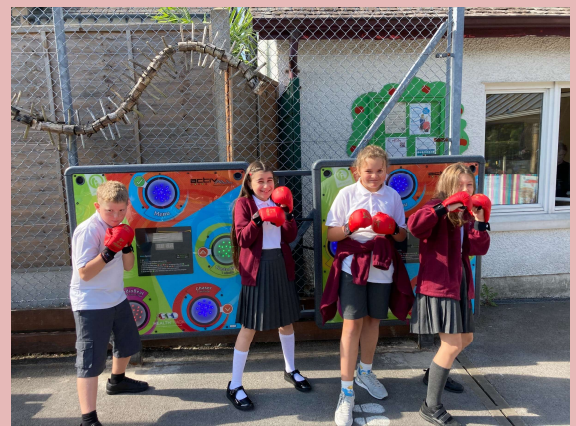
Enjoying our new play equipment in the sunshine this week