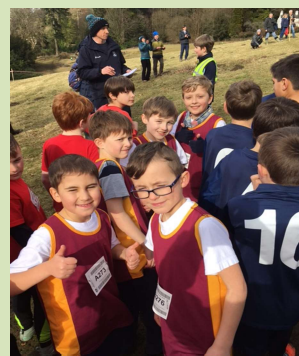
Our children did you all proud at the Windermere School Cross Country Race on Wednesday